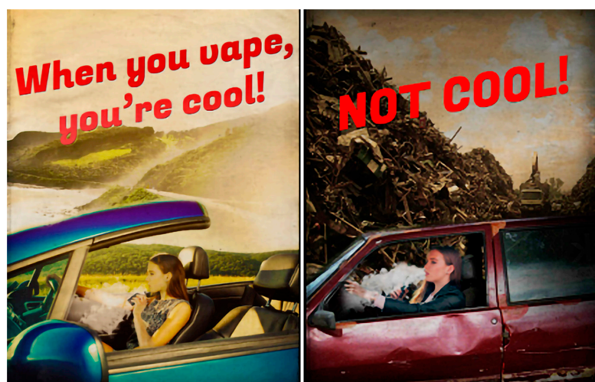
Figure 1. Screen shots from Reality Check, a component targeting students' social images of youth who vape e-cigarettes.